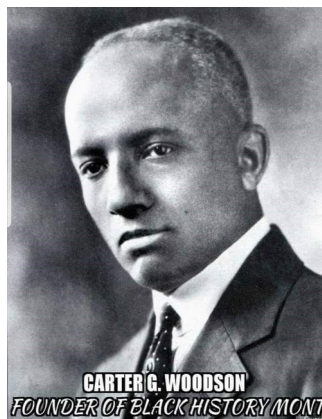
CARTER G. WOODSON FOUNDER OF BLACK HISTORY MONTH

El Mes de la Historia Afroamericana, también conocido como Mes de la Historia Afroamericana, se originó a partir de los esfuerzos del historiador Dr. Carter G. Woodson, quien estableció la Semana de la Historia Negra en 1926. El objetivo era promover la conciencia sobre la historia y los logros de los negros. La Semana de la Historia Negra se amplió a una celebración de un mes de duración en 1976, cuando se conoció oficialmente como Mes de la Historia Negra. Este período sirve como una oportunidad para resaltar las importantes contribuciones de los afroamericanos a lo largo de la historia. El Mes de la Historia Afroamericana fomenta el diálogo, la educación, la apreciación cultural y desempeña un papel vital en la promoción de la inclusión y la sensibilización sobre las diversas experiencias dentro de la comunidad negra.